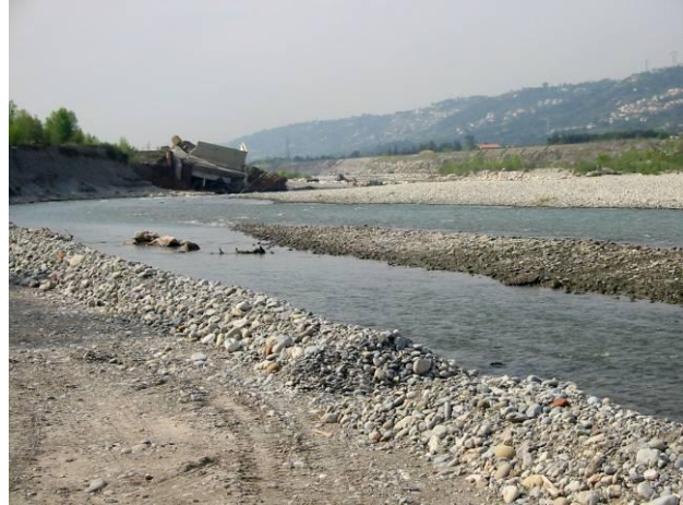
Plant 3, after destruction of sill number 3 by the 1994’s flood, Var, France

NB Indicator “benthic macro invertebrate” doesn’t seem pertinent.