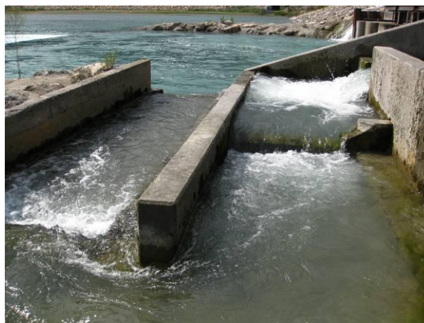
Fish ladder sill 4 th, Var, France