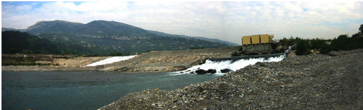
Sill 4 th , Var, France

There're several power plants installed. Therefore, to run the software we add the heights and flow rates to rationalize as if we had only one power plant.